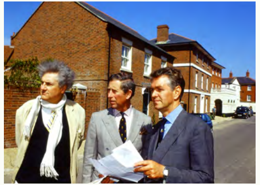
LEON KRIER AND ANDREW HAMILTON WITH THE PRINCE OF WALES