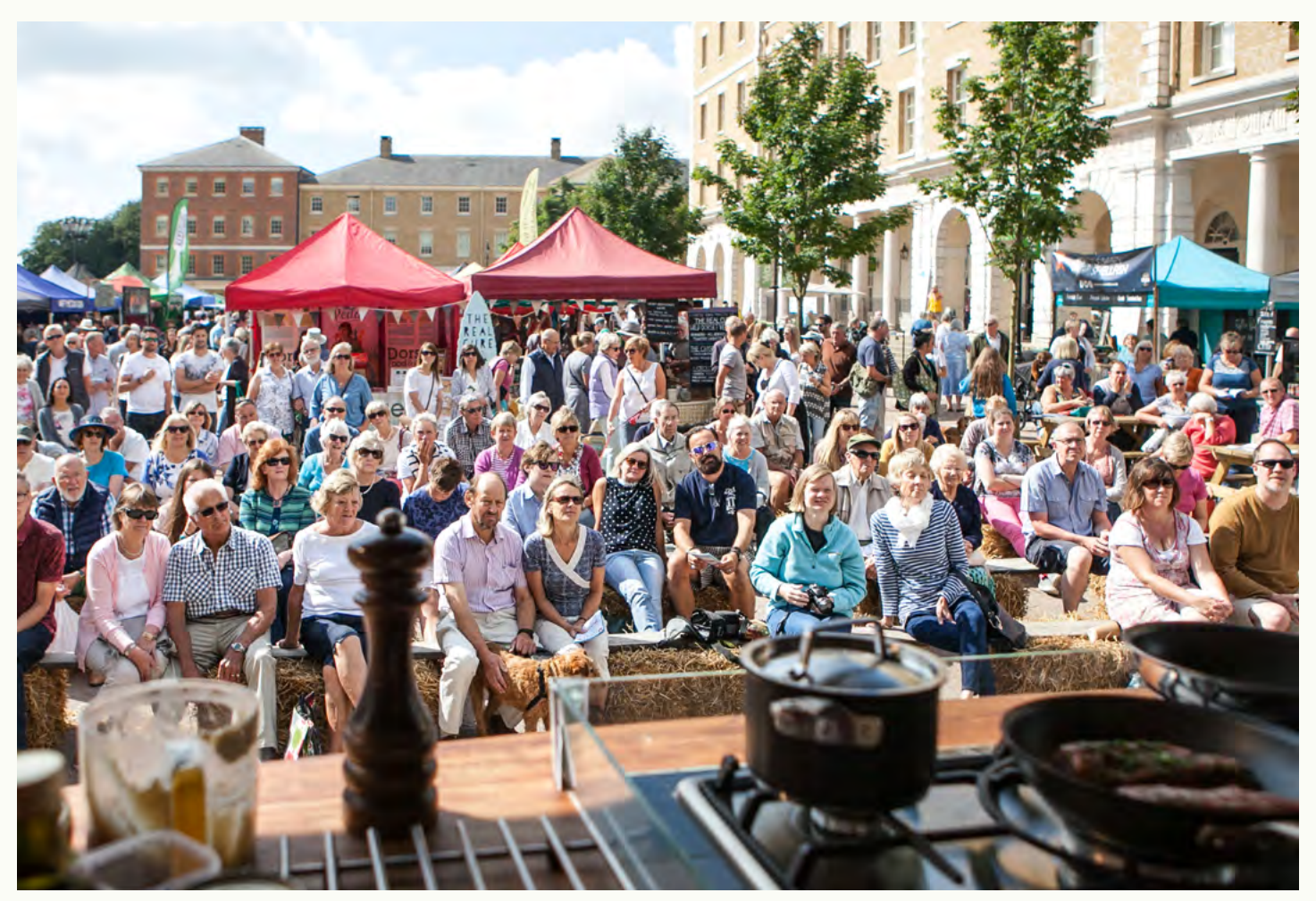
DORSET FOOD & ARTS FESTIVAL HELD EVERY AUGUST IN QUEEN MOTHER SQUARE