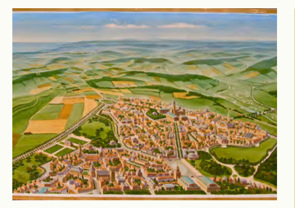
ILLUSTRATED MAP OF THE POUNDBURY VISION