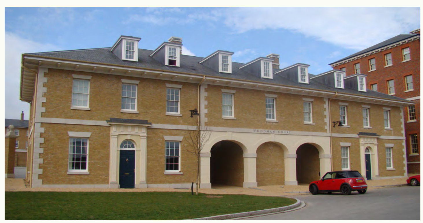
POUNDBURY IS DELIVERING 35% AFFORDABLE HOUSING INTERSPERSED ACROSS THE DEVELOPMENT