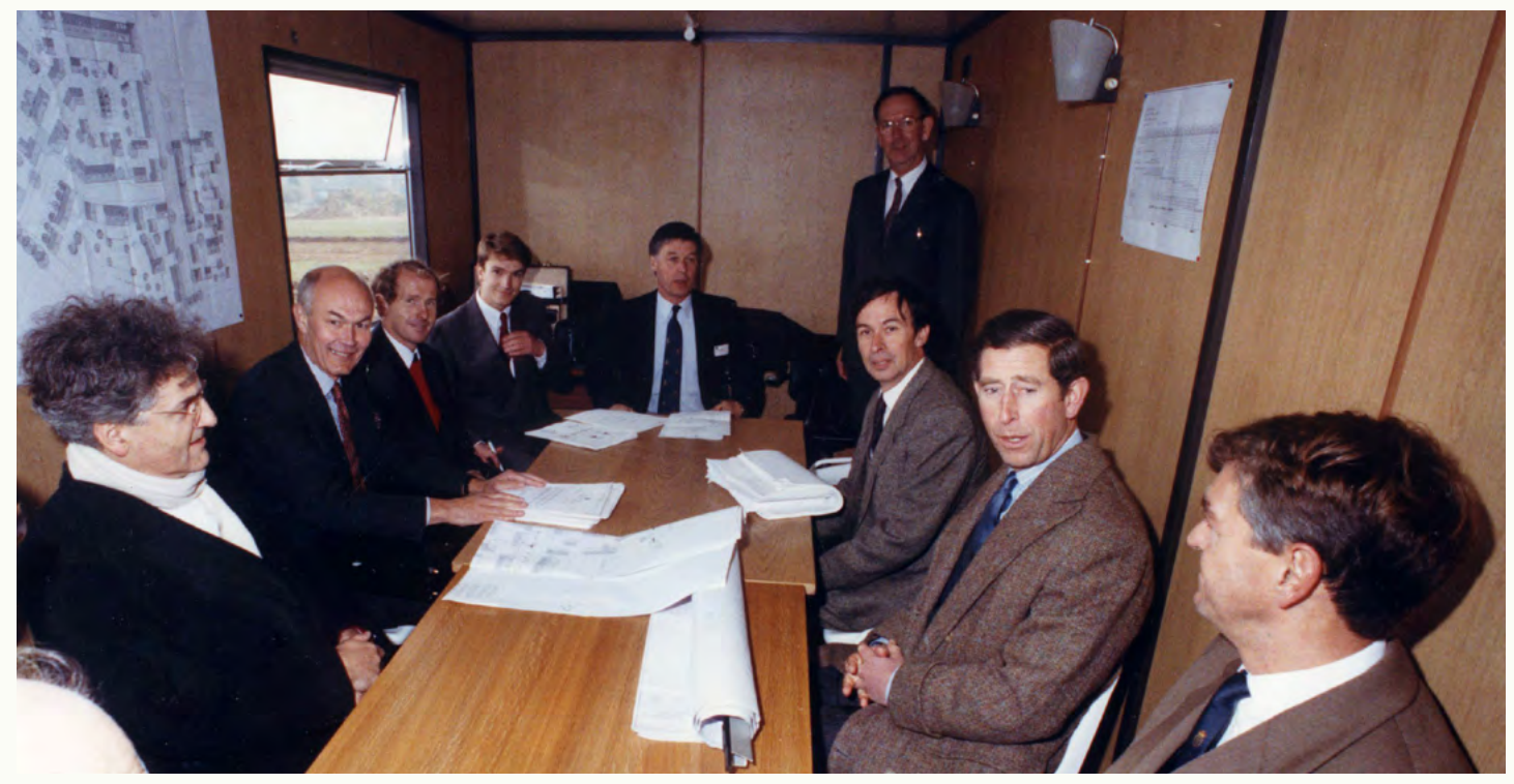
HRH THE PRINCE OF WALES AT THE FIRST SITE MEETING IN 1993