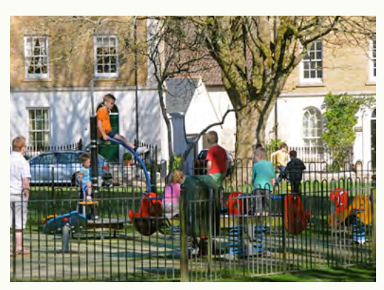
WOODLAND CRESCENT PLAY AREA