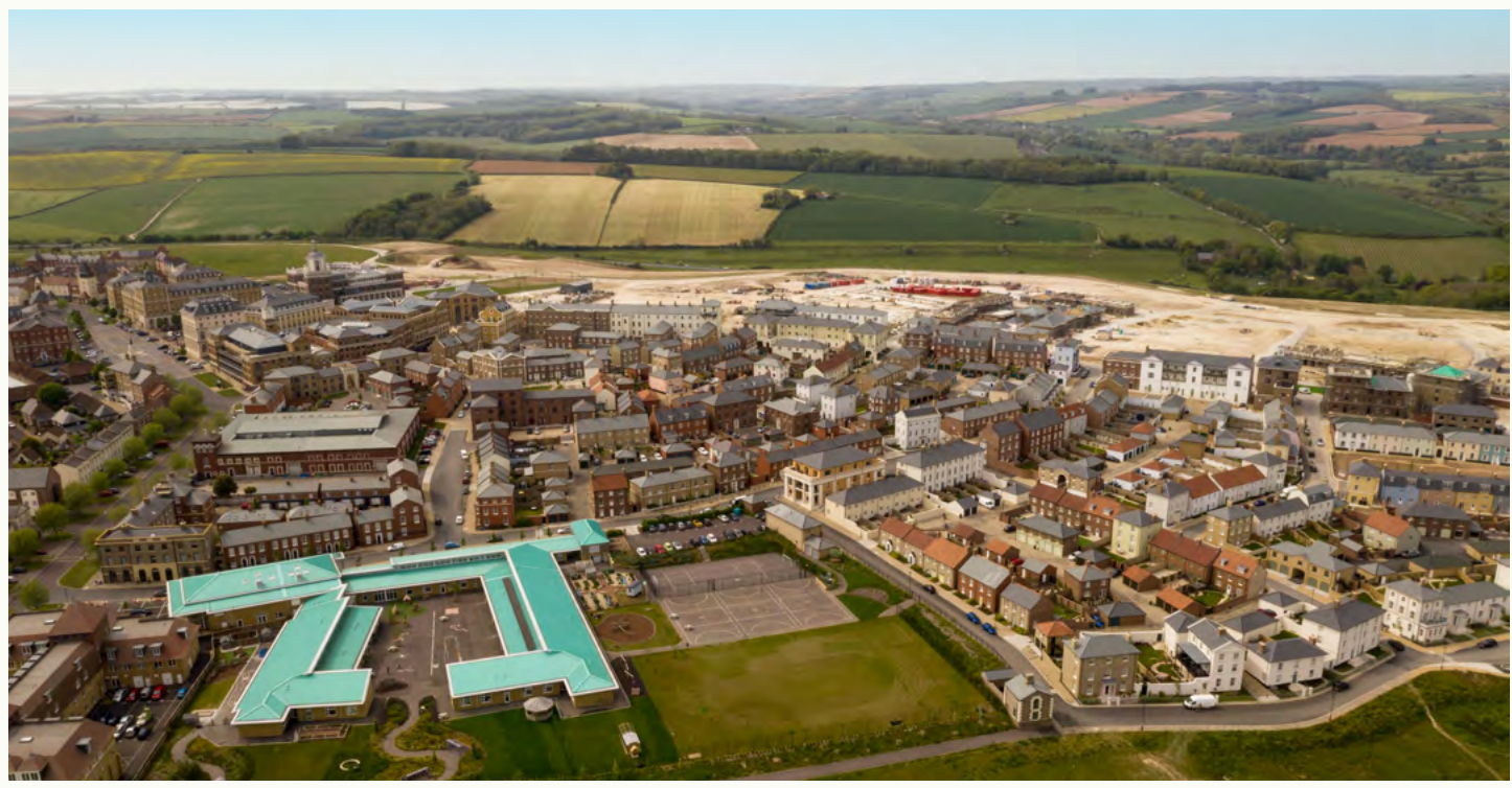
NORTH EAST QUADRANT, MAY 2019