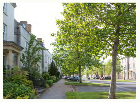
PEVERELL AVENUE EAST