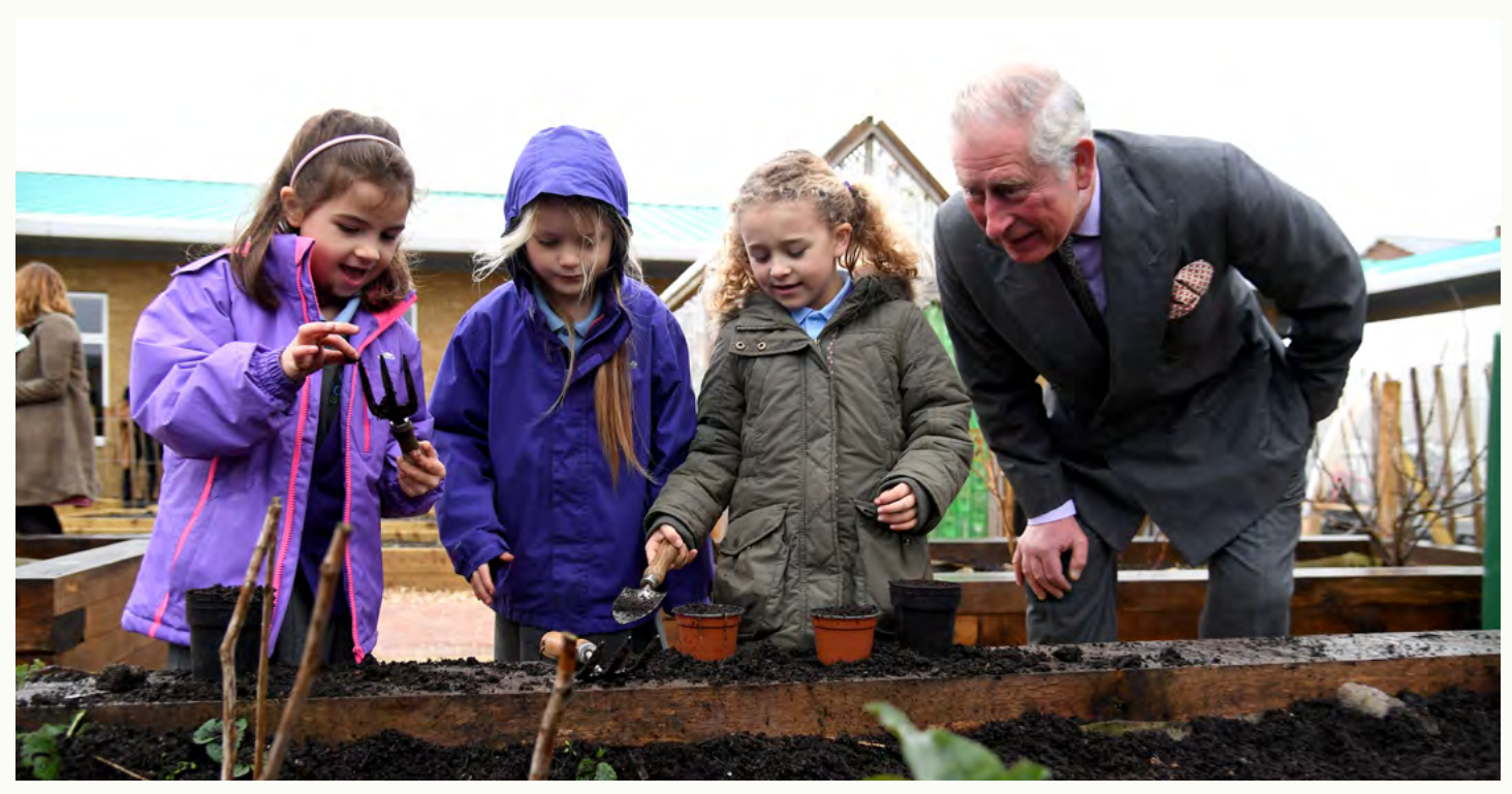
HRH THE PRINCE OF WALES BEING SHOWN DAMERS FIRST SCHOOL'S ECO GARDEN BY SCHOOLCHILDREN