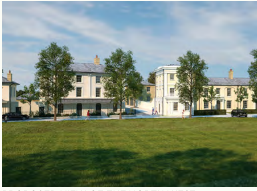
PROPOSED VIEW OF THE NORTH WEST QUADRANT