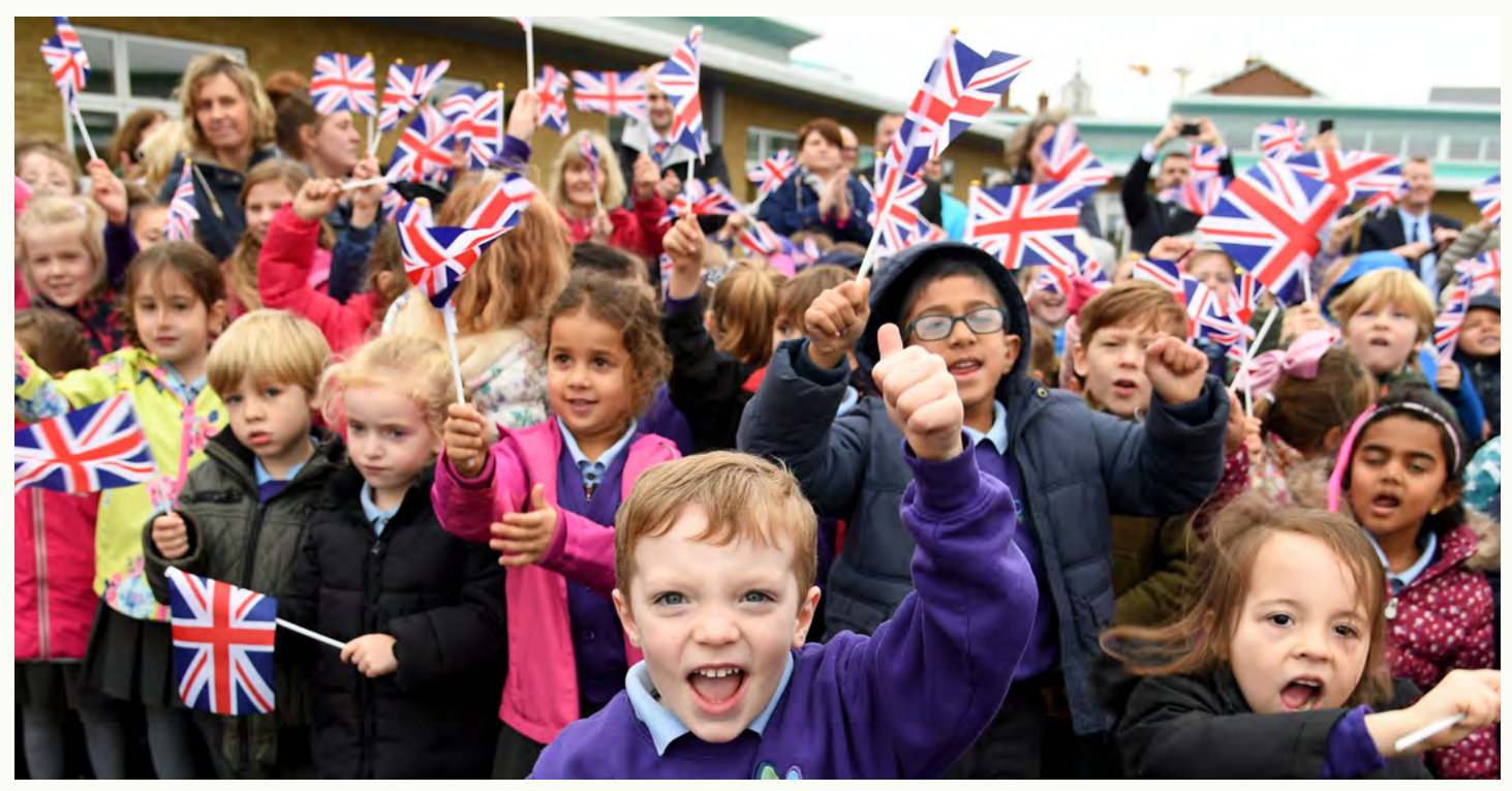
DAMERS FIRST SCHOOL CHILDREN