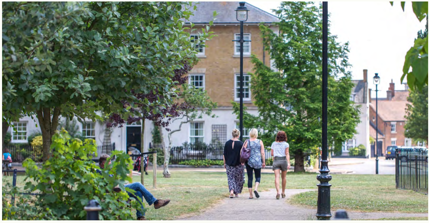
POUNDBURY IS DESIGNED SO MOST DAILY NEEDS CAN BE MET ON FOOT