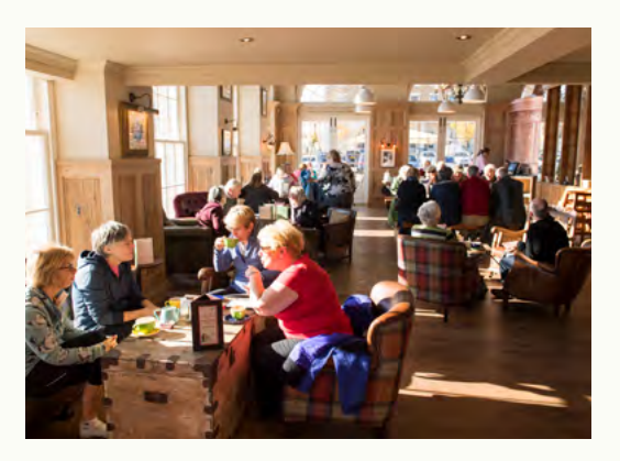
DUCHESS OF CORNWALL INN