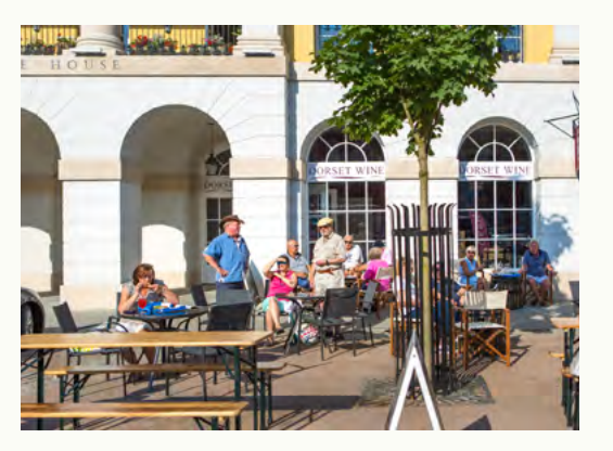
QUEEN MOTHER SQUARE