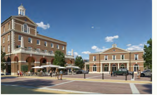
PROPOSED CROWN AND MARKET SQUARE