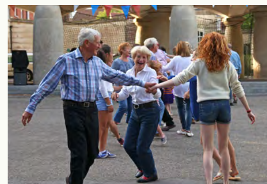
COMMUNITY EVENT IN PUMMERY SQUARE