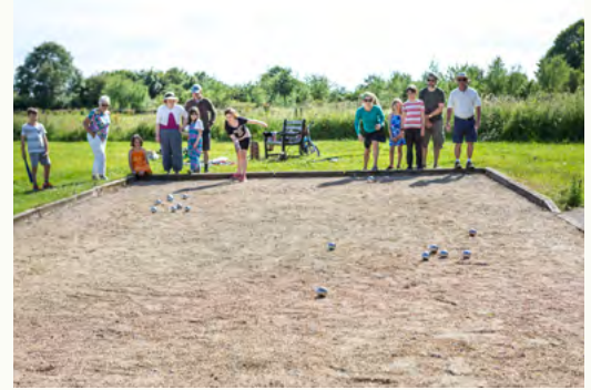
FAMILIES PLAYING ON THE PÉTANQUE AREA