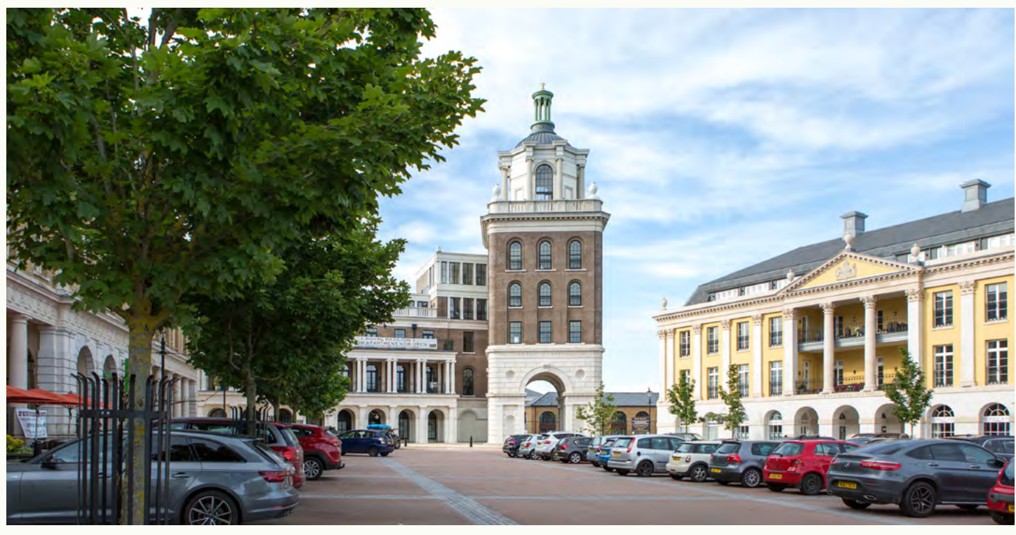
VIEW OF QUEEN MOTHER SQUARE TOWARDS ROYAL PAVILION